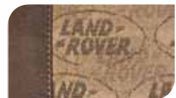
Land Rover Logo Brown