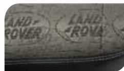
Land Rover Logo Grey