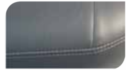
Dark Grey Vinyl