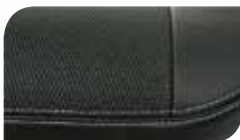
XS Black Rack