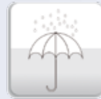
Waterproof Seat Cover

Simply go to www.exmoortrim.co.uk and look through our extensive range of products. Here you can choose to view videos of fitting and what we do and even join the Exmoor Trim Blog! Where you can automatically receive newsletter and competitions and of course special offers the moment they become available. We will also be launching our new products on line so you will receive these straight away.