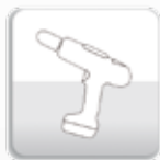
Drilling Maybe Required