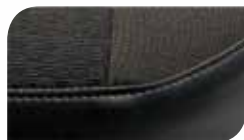
Black Span Modus