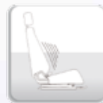
Adjustable Lumbar Support