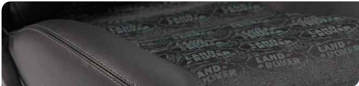
Land Rover Logo Black